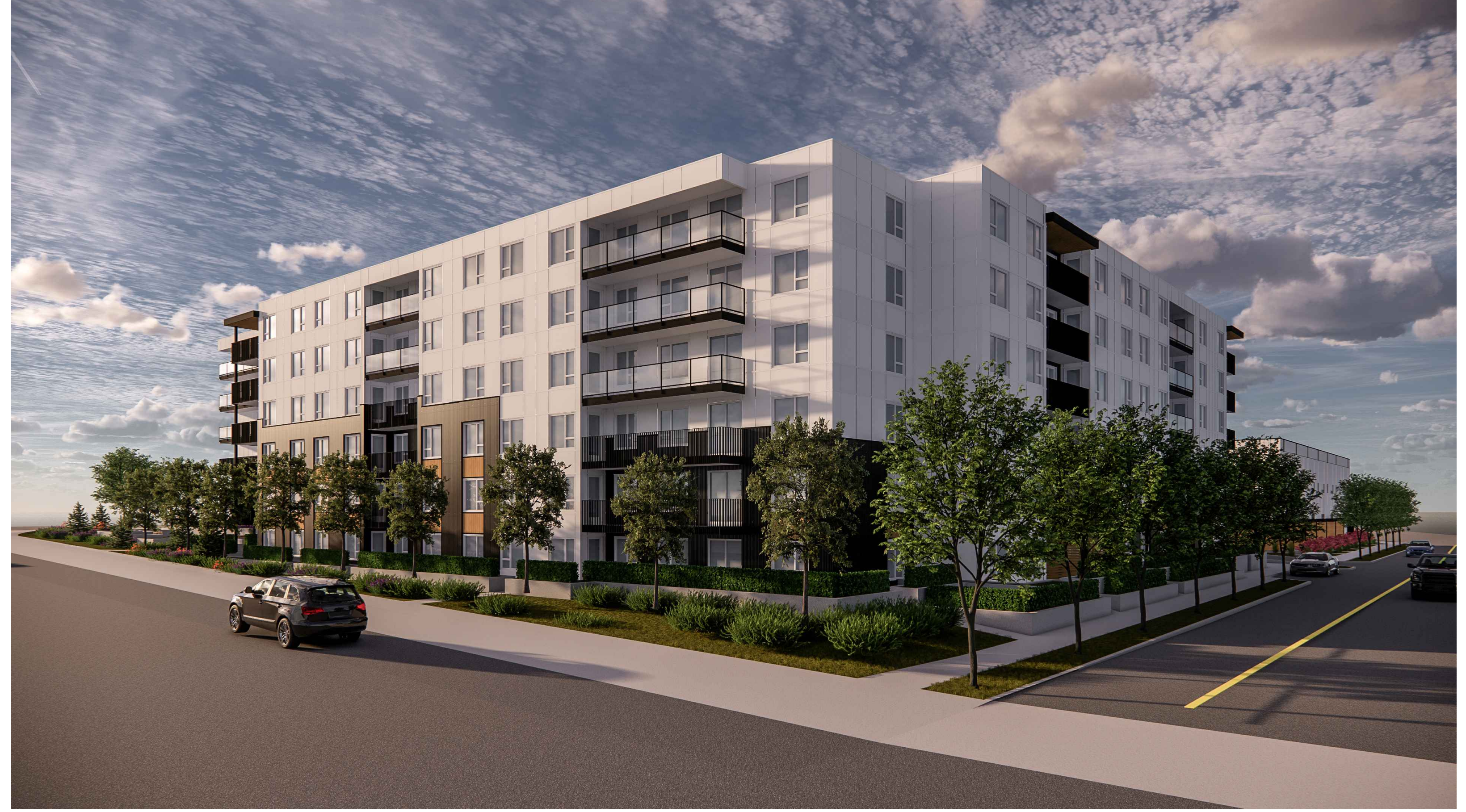
ARTISTS RENDERINGS ARE TO DEMONSTRATE ARCHITECTURE ONLY. REFER TO LANDSCAPE PLANS FOR PLANTING & SITE DESIGN.