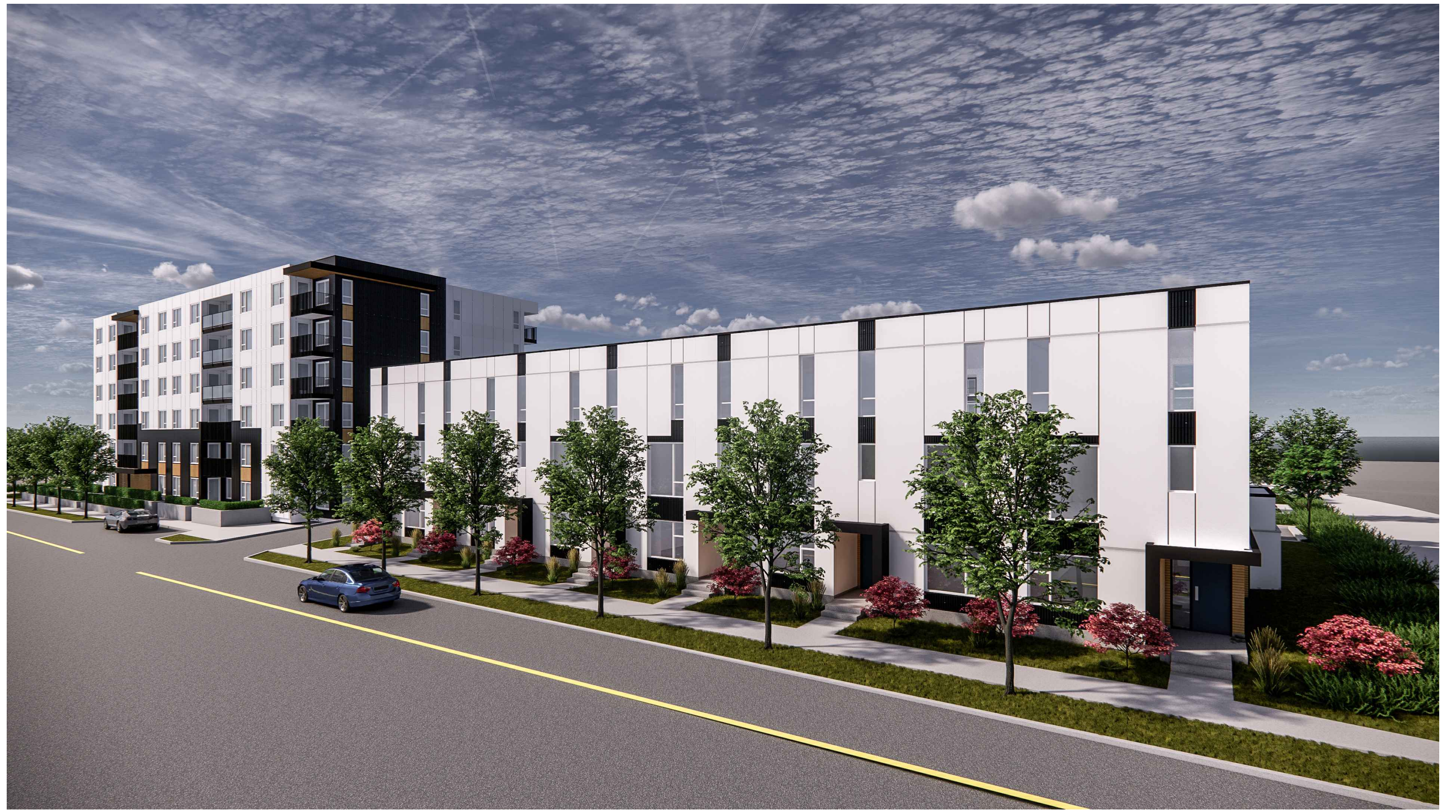
ARTISTS RENDERINGS ARE TO DEMONSTRATE ARCHITECTURE ONLY. REFER TO LANDSCAPE PLANS FOR PLANTING & SITE DESIGN.