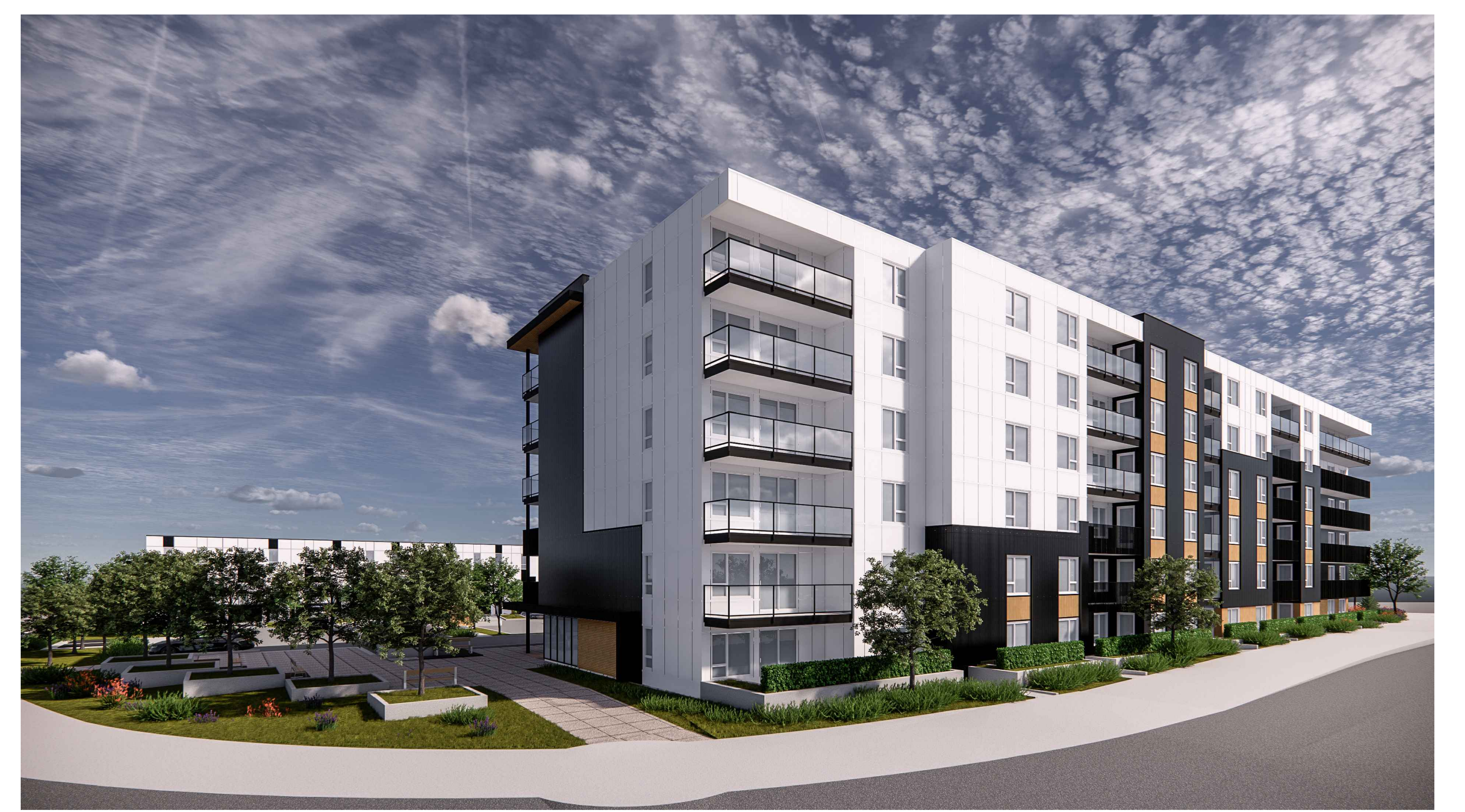
ARTISTS RENDERINGS ARE TO DEMONSTRATE ARCHITECTURE ONLY. REFER TO LANDSCAPE PLANS FOR PLANTING & SITE DESIGN.