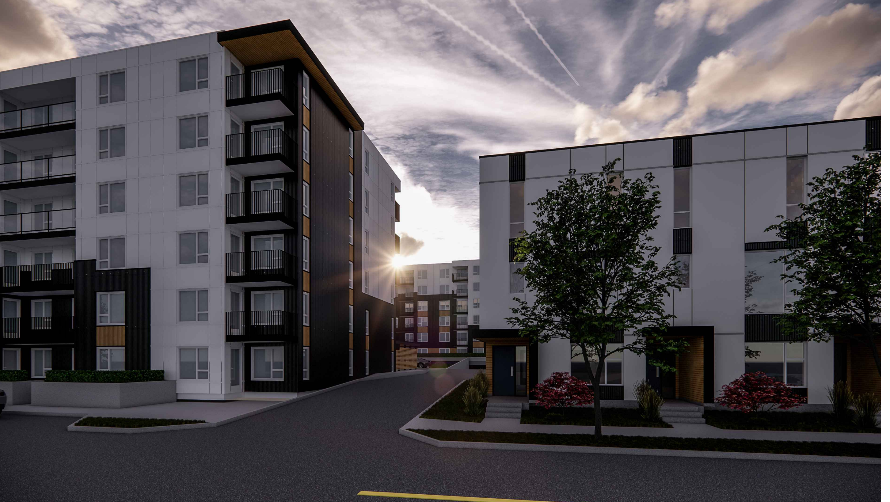
ARTISTS RENDERINGS ARE TO DEMONSTRATE ARCHITECTURE ONLY. REFER TO LANDSCAPE PLANS FOR PLANTING & SITE DESIGN.

3 SITE EAST PERSPECTIVE - VIEW TO ENTRY ROAD