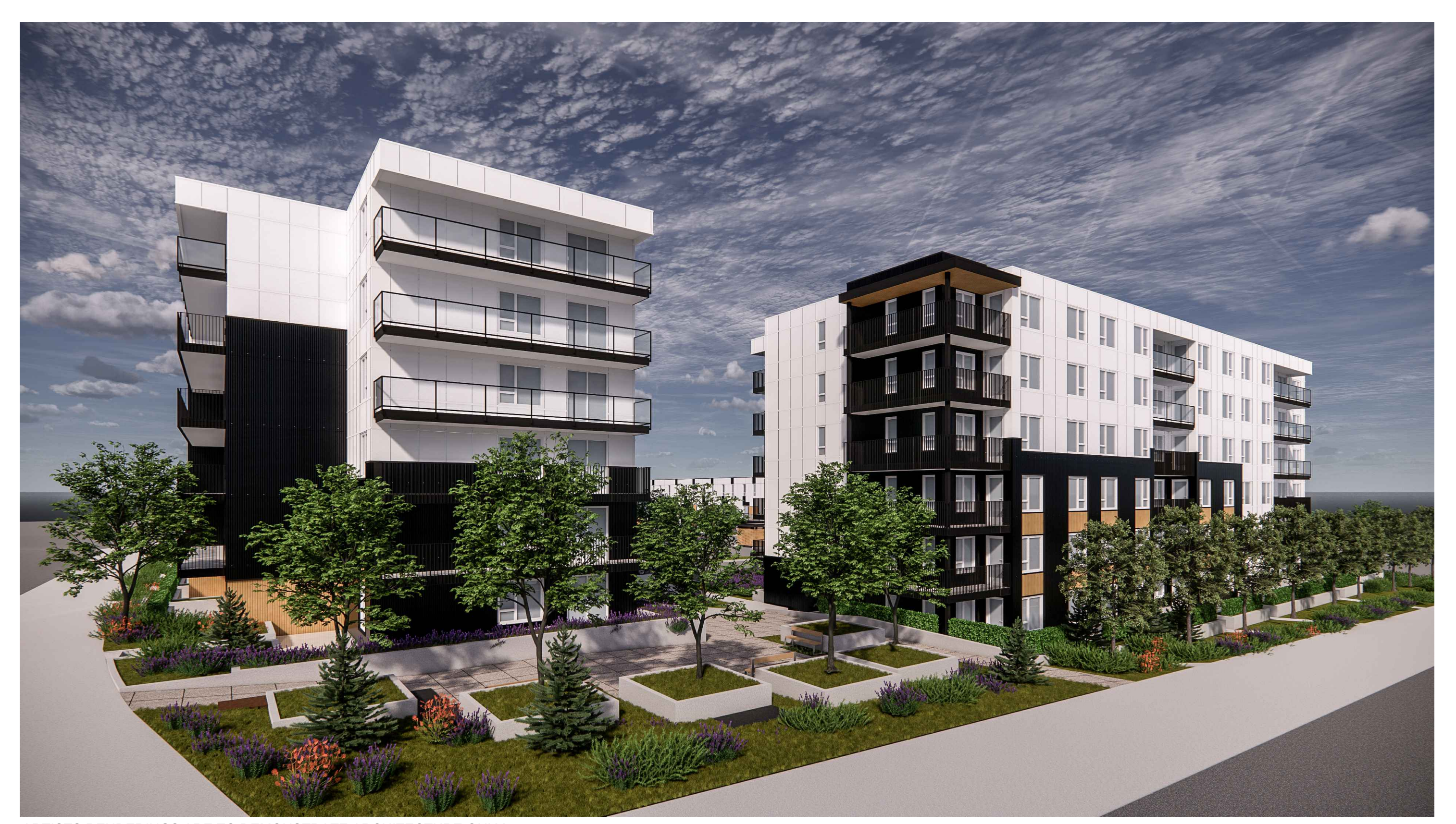
ARTISTS RENDERINGS ARE TO DEMONSTRATE ARCHITECTURE ONLY. REFER TO LANDSCAPE PLANS FOR PLANTING & SITE DESIGN.